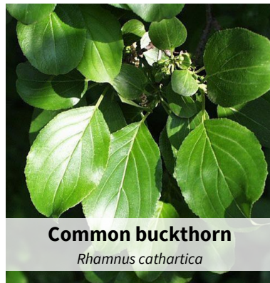
Common buckthorn Rhamnus cathartica