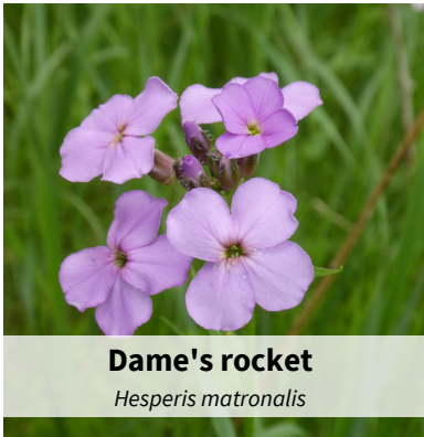
Dame's rocket Hesperis matronalis