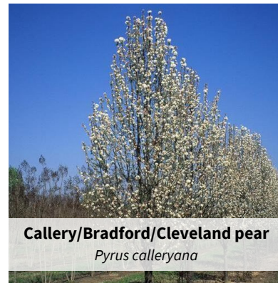
Callery/Bradford/Cleveland pear Pyrus calleryana