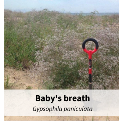
Baby's breath Gypsophila paniculata