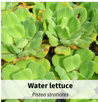
Water lettuce Pistia stratiotes

Go Beyond Beauty celebrates garden professionals, at no cost to them, (nurseries, growers, and landscapers) who commit to not selling or using high-priority invasive species. Other participants include garden clubs, private businesses, and individuals who are dedicated to the same mission.