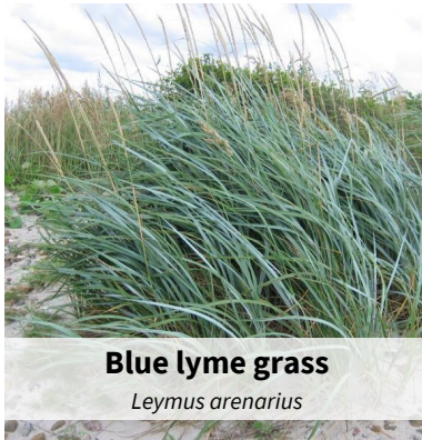
Blue lyme grass Leymus arenarius