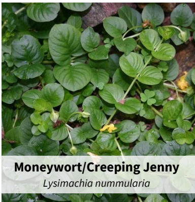
Moneywort/Creeping Jenny Lysimachia nummularia