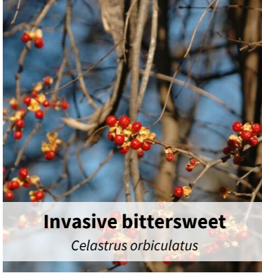
Invasive bittersweet Celastrus orbiculatus