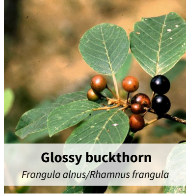
Glossy buckthorn Frangula alnus/Rhamnus frangula