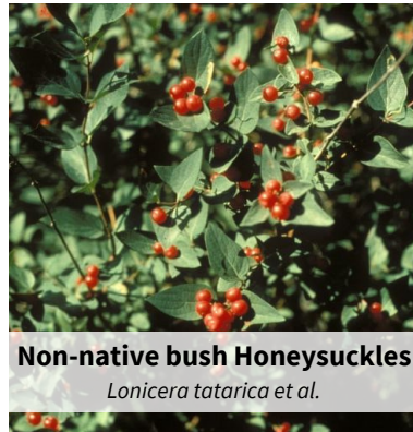
Non-native bush Honeysuckles Lonicera tatarica et al.