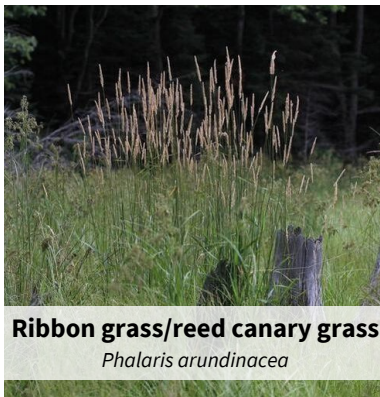
Ribbon grass/reed canary grass Phalaris arundinacea