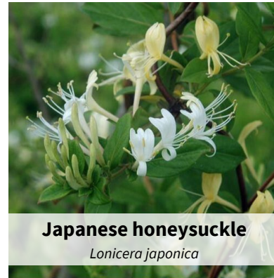
Japanese honeysuckle Lonicera japonica